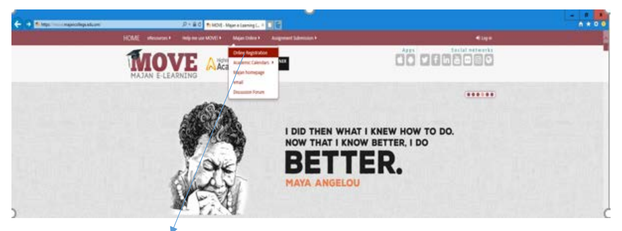
On clicking the above link following page will open:

The link for online registration is available on MOVE under "Majan Online" - Online registration -