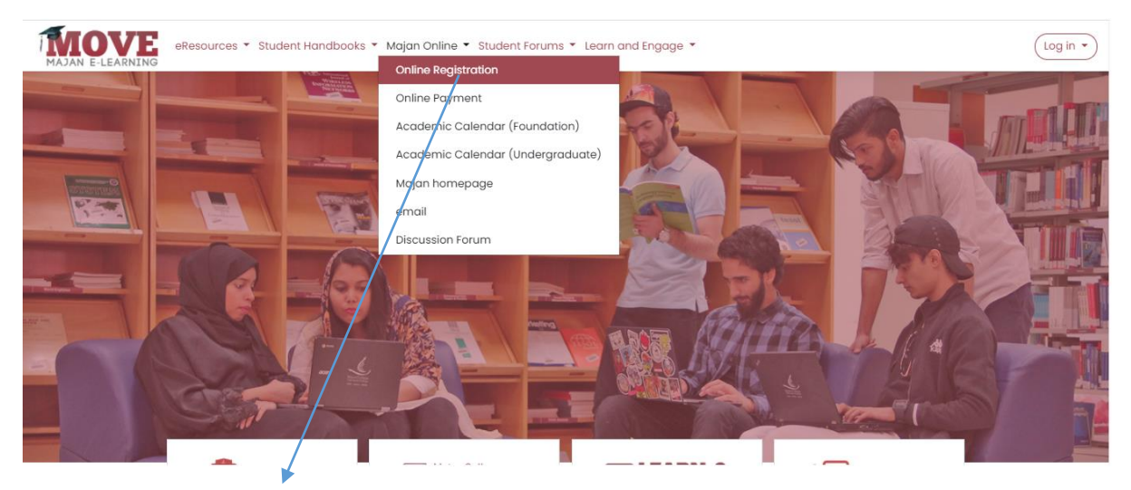
On clicking the above link following page will open:

The link for online registration is available on MOVE under "Majan Online" - Online registration -